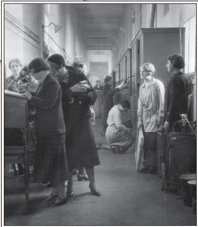
Women students of painting signing the Attendance Book at the Royal College of Art in London.